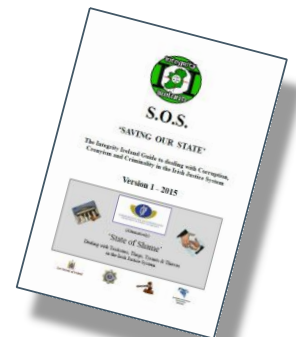
I-I 'S.O.S. Guide'